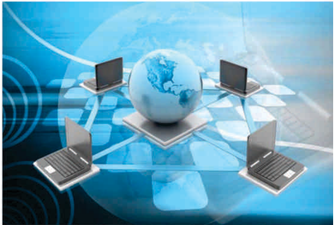
City of Choice™ Travel & Tours' innovative online solutions bring the world to you.

This self-branded online booking portal assists corporates to better control their travel budgets, manage their travelling personnel and choose from a vast database of travel offers. This tool also boasts useful additional features, such as location-specific content and the ability to reserve seats for 72 hours.